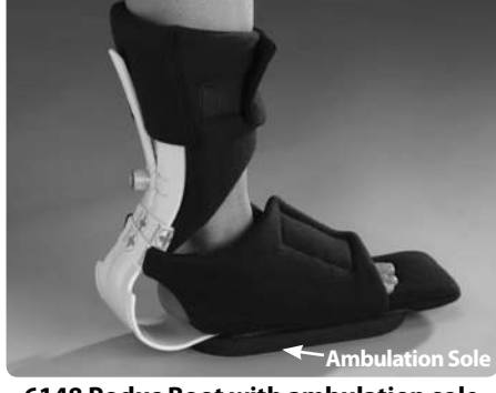
6148 Podus Boot with ambulation sole