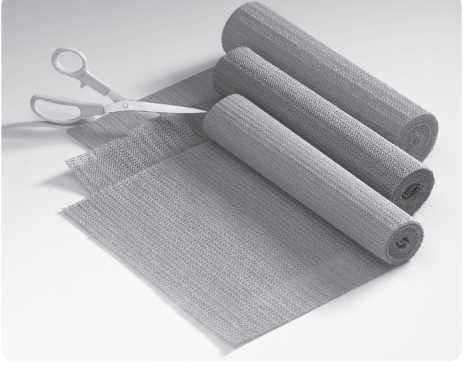
REF 6301 Green, REF 6301B Blue, REF 6301R Red

EXCAUTION When using Posey Grip alone to prevent sliding, the patient's skin must be protected by clothing to prevent "shearing."